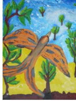
Journey of dream (2008, 17 yrs old)