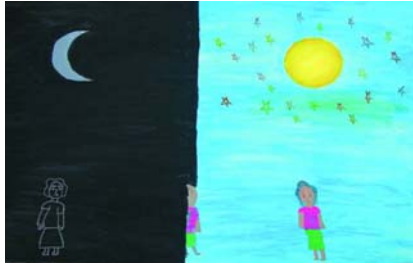
Paint brightness into the night (2004, 13 yrs old)